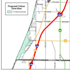
Coastal Overlay Zone 300 ft. inland from the shore of Lake Michigan